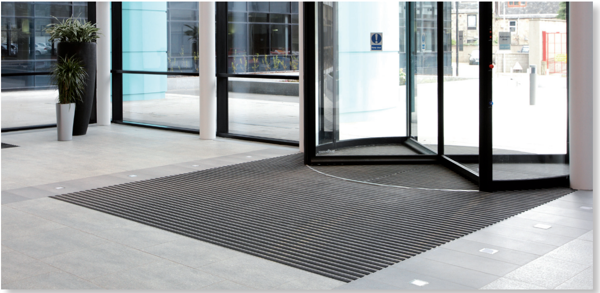
Esplanade Plus Primary Barrier Matting